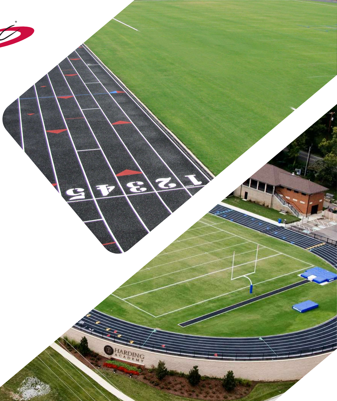
Top image: Harding Academy Nashville, Tennessee

Made from select black SBR rubber granules bound with a black pigmented Plexitrac® Binder, the track is top coated with a highly pigmented black finish coat using either Plexitrac® Coating or Surfacer. This provides the track with additional long-term UV light stability and abrasion resistance.